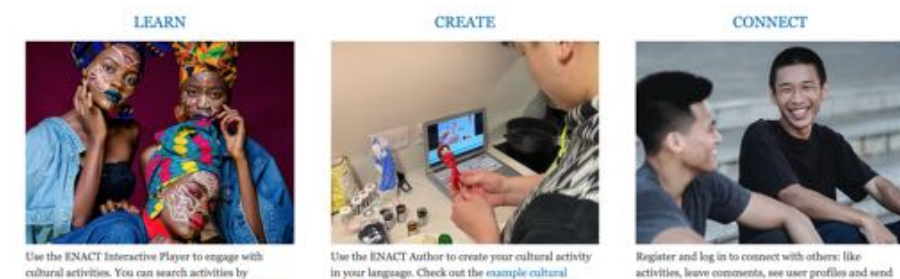
language. Check out the example cultural es to give you ideas. Check out our "How to" for advice on how to use the ENACT Author and

Please feel free to leave comments on any activities you try, and if you're inspired, use the CREATE tab to upload your own activity!